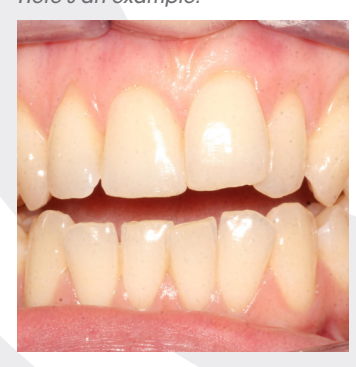
Here's an example:

Some of the less severe AOBs can however be corrected by molar intrusion using Invisalign. Essentially the first and second molars are intruded to allow some forward and upwards autorotation of the mandible. These cases usually require the extraction of erupted upper and occasionally lower third molars. Correct use of Invisalign attachments and forces can sequentially intrude the buccal segments. This together with levelling of the occlusal planes can give excellent results.